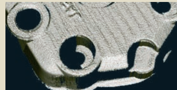
Using a COG-based 3D camera

*Experimental results after computing normal distance from detected points to stripe, scanning a flat surface.