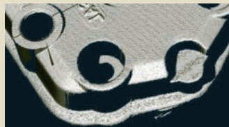
Using the Peak Detector